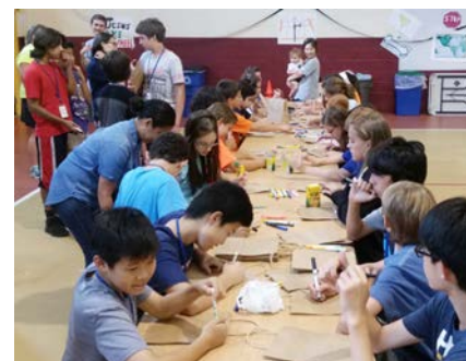
Writing letters for the elderly in retirement homes