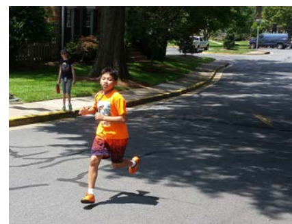
Running to deliver notes for food drive