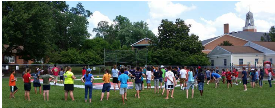
Playing baby pool kickball

The second day followed the first's progression of service, fun, and faith. After Mass and breakfast, the students