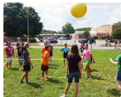
Engaging in team-building game

On the final day of the workcamp, the students returned to the surrounding neighborhoods to collect food that had been donated for the St. Vincent de Paul food drive. They then organized the food to be stored and distributed. Next, the group made cards for elderly persons in retirement homes and visited them for several hours. They gave the residents their cards of kind sentiments and shared some of their talents with them for entertainment. Back at the Parish, the students heard a reflection about our need to "recalculate" our lives according to God's will and the importance of learning to listen to the Holy Spirit. At the end of the Workcamp, the students were joined by their parents for Mass, followed by an ice cream party to celebrate their time of service to God and His Church.